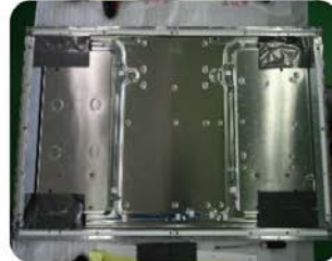
TV FFC Cable