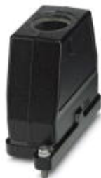
HEAVYCON B16 sleeve housing, HPR series, with screw locking, with M32 thread, straight outlet, for increased environmental and EMC requirements

Please be informed that the data shown in this PDF Document is generated from our Online Catalog. Please find the complete data in the user's documentation. Our General Terms of Use for Downloads are valid ( http://phoenixcontact.com/download )