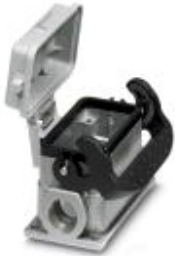
HEAVYCON box mounting base B10, with double locking latch, height 52 mm, with supports 2xM25 and protective cover

Please be informed that the data shown in this PDF Document is generated from our Online Catalog. Please find the complete data in the user's documentation. Our General Terms of Use for Downloads are valid ( http://download.phoenixcontact.com )