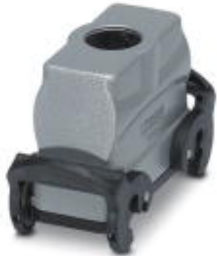
HEAVYCON B16 coupling housing, with double locking latch, height: 82 mm, with 1 x M32 thread, straight cable outlet

Please be informed that the data shown in this PDF Document is generated from our Online Catalog. Please find the complete data in the user's documentation. Our General Terms of Use for Downloads are valid ( http://phoenixcontact.com/download )