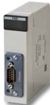
Slave units for CANopen FP2-CAN-S FPG-CAN-S