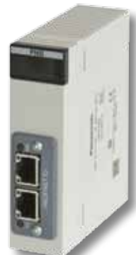
Slave units for PROFINET IO FP2-PRT-S FPG-PRT-S