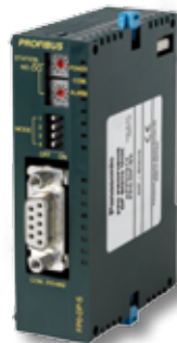
Slave unit for PROFIBUS DP (FP0/FP0R expansion unit also compatible with FP-X) FP0-DPS2