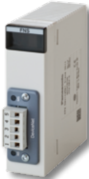
Slave units for DeviceNet FP2-DEV-S FPG-DEV-S