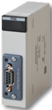
Slave units for PROFIBUS DP FP2-DPV1-S FPG-DPV1-S