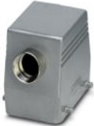
HEAVYCON sleeve housing D50, for double locking latch, height 76 mm, with support 1xM25, lateral conductor exit

Please be informed that the data shown in this PDF Document is generated from our Online Catalog. Please find the complete data in the user's documentation. Our General Terms of Use for Downloads are valid ( http://phoenixcontact.com/download )