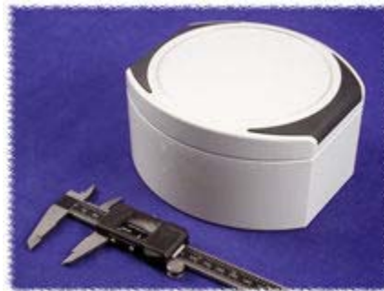
click to enlarge Relative View Caliper opened to 1" (25.4mm)

Path: Home > Enclosure Index > ROLEC-HAMMOND Aluminum Product Index > Round R280 aluDISC Series