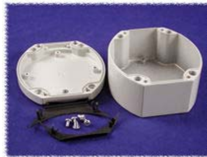
click to enlarge Internal View