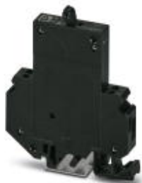
Thermomagnetic circuit breaker, 1-pos., normal blow, 1 N/C contact, with universal foot for mounting on NS 32 or NS 35

Please be informed that the data shown in this PDF Document is generated from our Online Catalog. Please find the complete data in the user's documentation. Our General Terms of Use for Downloads are valid ( http://phoenixcontact.com/download )