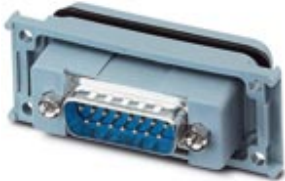
D-SUB panel mounting frame, shell size 2, with 15 signal contacts, pin, gender changer, shielded, IP67 degree of protection

Please be informed that the data shown in this PDF Document is generated from our Online Catalog. Please find the complete data in the user's documentation. Our General Terms of Use for Downloads are valid ( http://phoenixcontact.com/download )