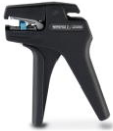
Stripping tool, for conductors and cables of 0.08 to 2.5 mm diameter

Please be informed that the data shown in this PDF Document is generated from our Online Catalog. Please find the complete data in the user's documentation. Our General Terms of Use for Downloads are valid ( http://download.phoenixcontact.com )