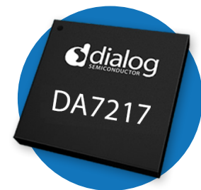
32 ball WLCSP package, 0.5 mm pitch

DA7217 contains two analog microphone input paths, or up to four digital microphone input paths, or a combination of both. The other chip in this family, the DA7218, has single-ended headphone outputs, and has been designed with headphone detect for use in accessories.