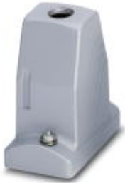
HEAVYCON ADVANCE EMV sleeve housing B6, with screw locking, height 100 mm, with 1xM20 thread, straight cable outlet

Please be informed that the data shown in this PDF Document is generated from our Online Catalog. Please find the complete data in the user's documentation. Our General Terms of Use for Downloads are valid ( http://download.phoenixcontact.com )